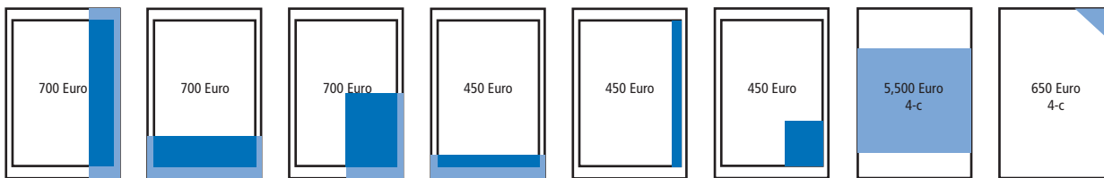
1/4 page 1/4 page 1/4 page 1/8 page 1/8 page 1/8 page junior cover page special ad